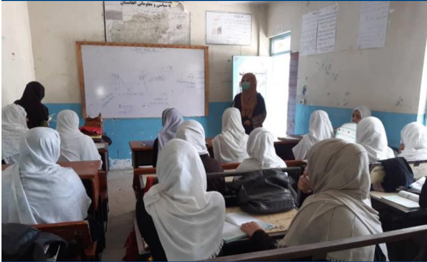
During September, IOM's Migration Health Unit has extended COVID-19 health education sessions to local schools in Kandahar province. To date 2,875 students in 92 classes across 9 schools have been reached. @ IOM, September 2020