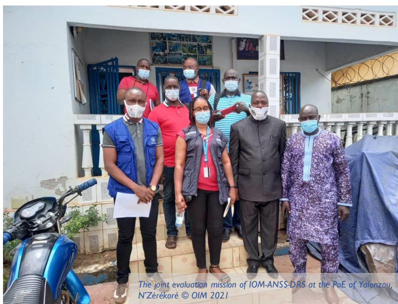
The joint evaluation mission of IOM-ANSS-DRS at the PoE of Yalenzou, N'Zérékoré

Thank you for watching the below videos :