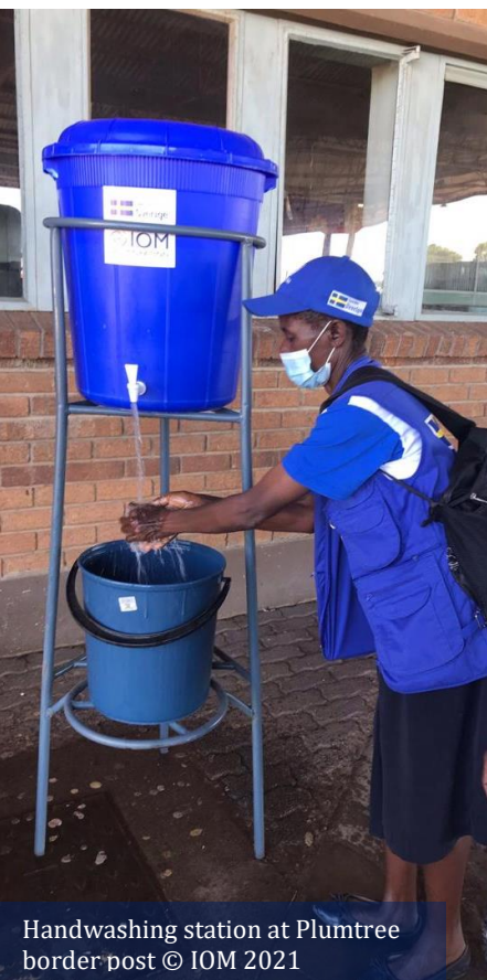
Handwashing station at Plumtree border post