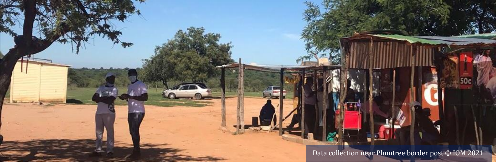
Data collection near Plumtree border post

The exercise was being chaired by the Mangwe District Development Coordinator. The Ministry of Health gave an update on the epidemiological situation in Plumtree at the opening of the session. Following an overview of flow monitoring, data collection, target areas, and risk of communication emphasizing transmission of COVID 19 and other health related issues, key informants were then encouraged to relate the information shared with situations in their daily lives and contribute their knowledge of their communities by identifying and locating PoEs, axes of mobility (routes) and Points of Congregation (PoCs) on maps, to identify places where travellers could interact with other travellers and/or the local community.