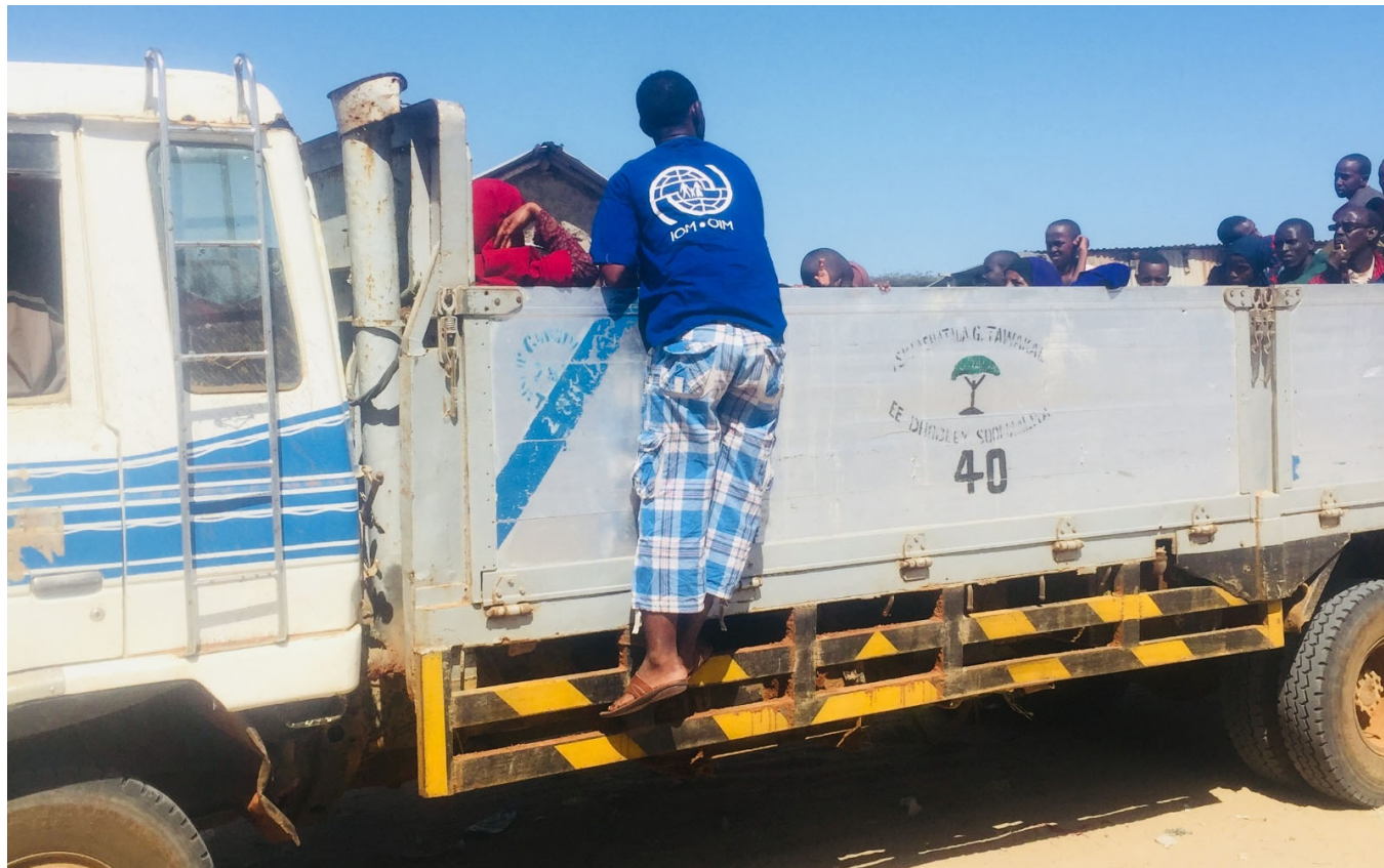
MTT Enumerator interviewing IDPs exiting in Kismayo on foot Last week, @, IOM Somalia 2018.

MTT aims to complement existing information management products on displacements and movements in Kismayo, by providing site level specific data on population movements on a regular basis, to assist agencies operating in sites and settlements with key information on: demographics of movement, area of origin, area of return/onward movement, reasons for movement and movement trends over time.