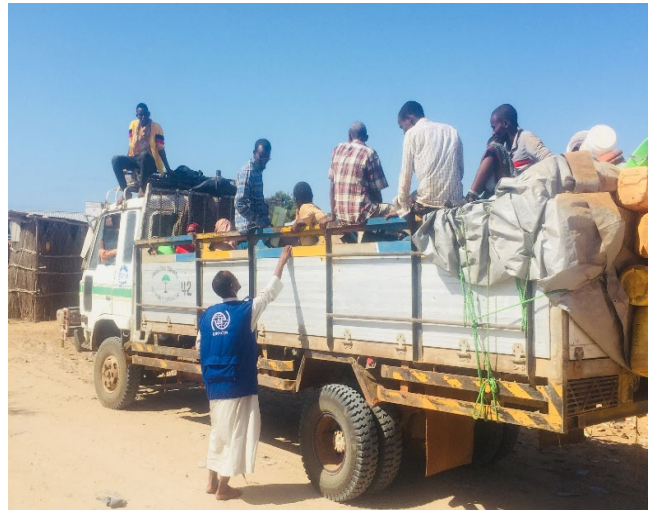
MTT Enumerator interviewing IDPs entering in Kismayo Last week, @, IOM Somalia 2018.