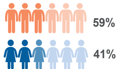
SEX (FIG. 2)